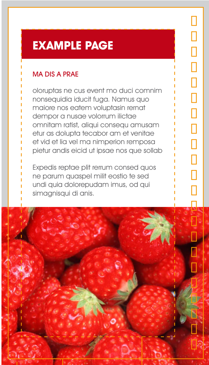
Right Hand page